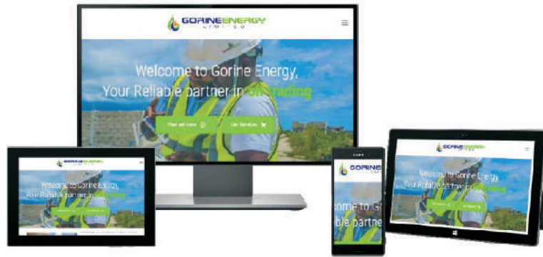
Website designed for Gorine Energy