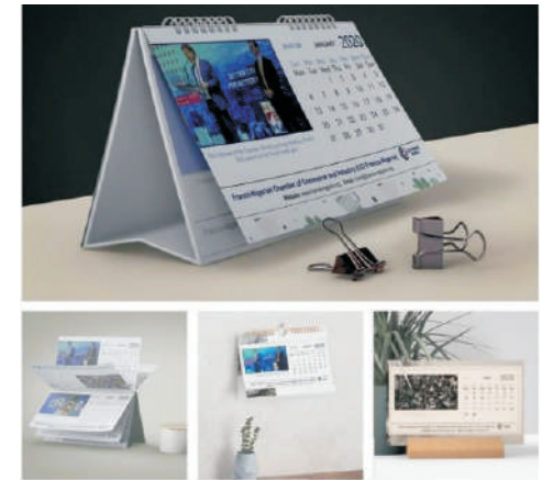
2020 Calendar designed for CCIFN