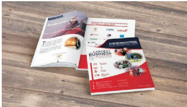
Brochure designed for CCNI